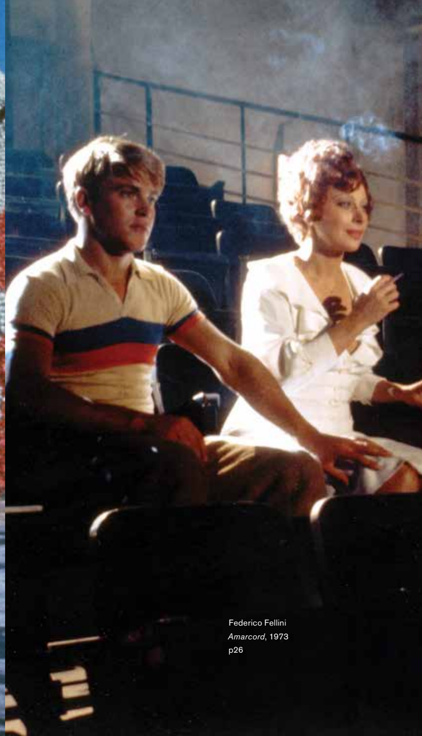
Federico Fellini Amarcord , 1973 p26