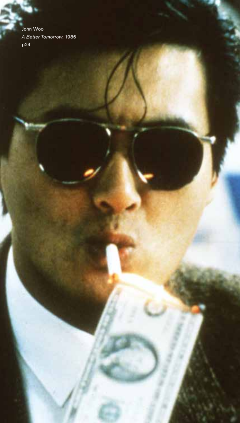
John Woo A Better Tomorrow , 1986 p24