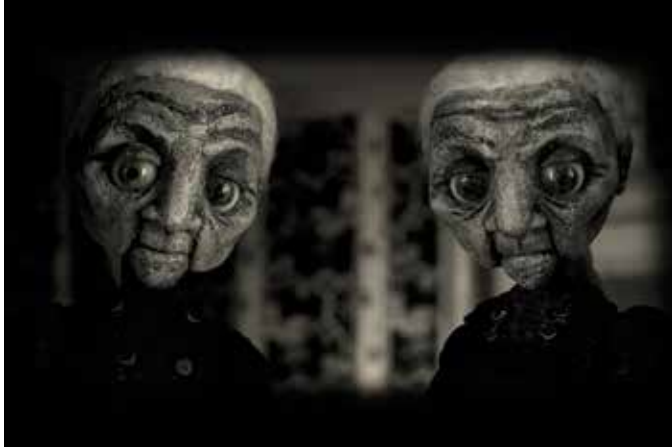
José Antonio Sistiaga Impressions from the Upper Atmosphere , 1989 p16