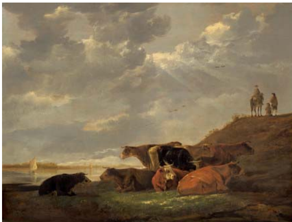
fig. 3 Aelbert Cuyp, River Landscape with Cows , 1645/1650, oil on panel, National Gallery of Art, Washington, Gift of Family Petschek (Aussig), 1986.70.1