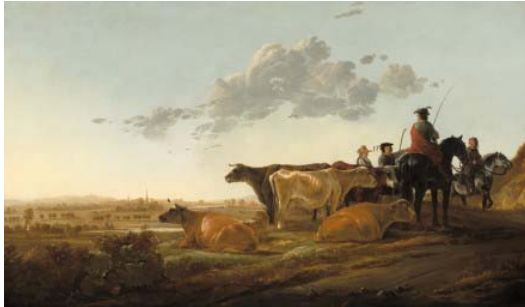
Aelbert Cuyp Dutch, 1620 - 1691