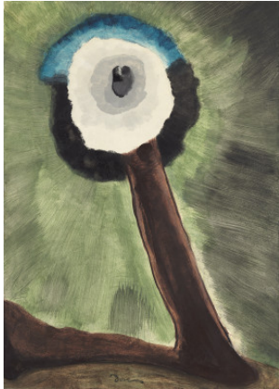
Arthur Dove American, 1880 - 1946