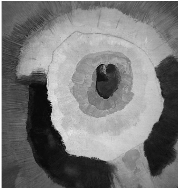
fig. 1 Detail of infrared reflectogram, Arthur Dove, Moon , 1935, oil on canvas, National Gallery of Art, Washington, Collection of Barney A. Ebsworth