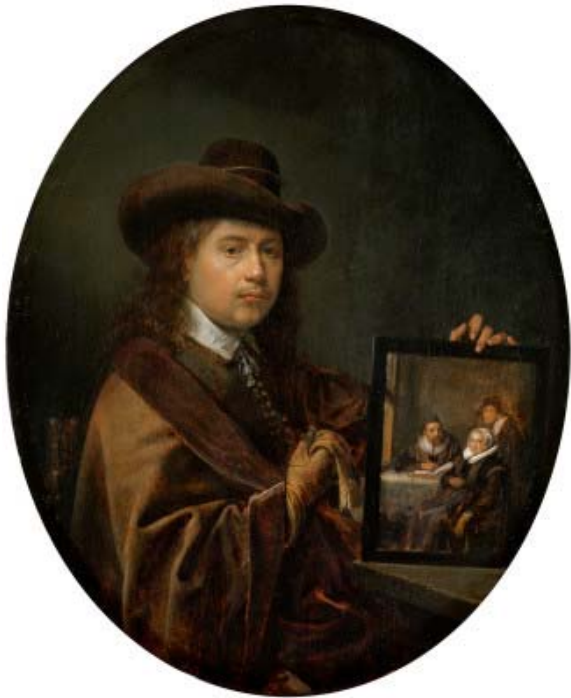
fig. 1 Gerrit Dou, Self-Portrait , c. 1655, oil on panel, Herzog Anton Ulrich-Museum, Braunschweig