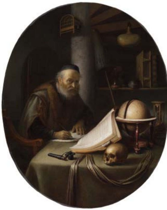
fig. 2 Gerrit Dou, Man Interrupted at His Writing , c. 1635, oil on panel, The Leiden Collection, New York.