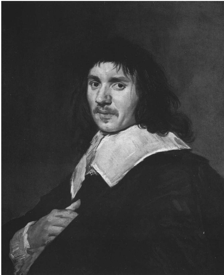
Fig. 1. 1942.9.28 prior to treatment

THE VAGARIES of Frans Hals' artistic reputation are more extreme than those of most artists. After having been the preeminent portrait painter in Haarlem during his day, he was almost totally forgotten after his death. It was not until the late nineteenth century that the vigorous and free brushwork that brought his portraits of Dutch burghers vividly to life was once again appreciated by critics, collectors, and contemporary artists. Paintings long relegated to obscurity in back rooms or in attics were proudly brought forward, sent to exhibitions, and sold to dealers and collectors eager to own his works. 5