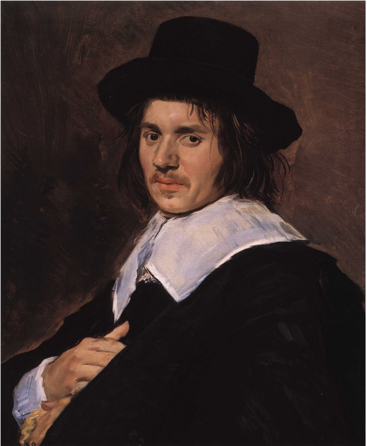
Frans Hals, Portrait of a Man , 1642.9.28