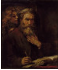
fig. 1 Rembrandt van Rijn, Saint Matthew and the Angel , 1661, oil on canvas, Musée du Louvre, Paris.