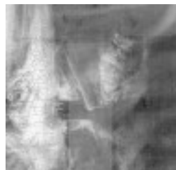
fig. 6 Detail of the head, X-radiograph composite, Rembrandt Workshop (Probably Constantijn van Renesse), The Descent from the Cross , 1650/1652, oil on canvas, National Gallery of Art, Washington, Widener Collection, 1942.9.61