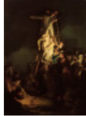
fig. 2 Rembrandt van Rijn, The Descent from the Cross , 1634, oil on canvas, Hermitage, Saint Petersburg.