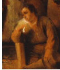
fig. 8 Detail of seated figure at right, Constantijn van Renesse, Conviviality near the Inn , oil on canvas, Corcoran Gallery of Art, Washington, William A. Clark Collection