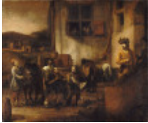
fig. 7 Constantijn van Renesse, The Good Samaritan , 1648, oil on canvas, Musée du Louvre, Paris.