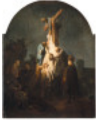
fig. 1 Rembrandt van Rijn, The Descent from the Cross , 1633, oil on panel, Alte Pinakothek, Munich.