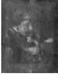
fig. 1 Upside down X-radiograph composite, Follower of Rembrandt van Rijn, Study of an Old Man , probably late 17th century, oil on panel, National Gallery of Art, Washington, Widener Collection, 1942.9.63