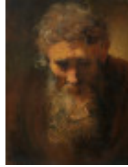
fig. 2 Follower of Rembrandt van Rijn, Study of an Old Man , probably late 17th century, oil on panel, National Gallery of Art, Washington, Widener Collection, 1942.9.63