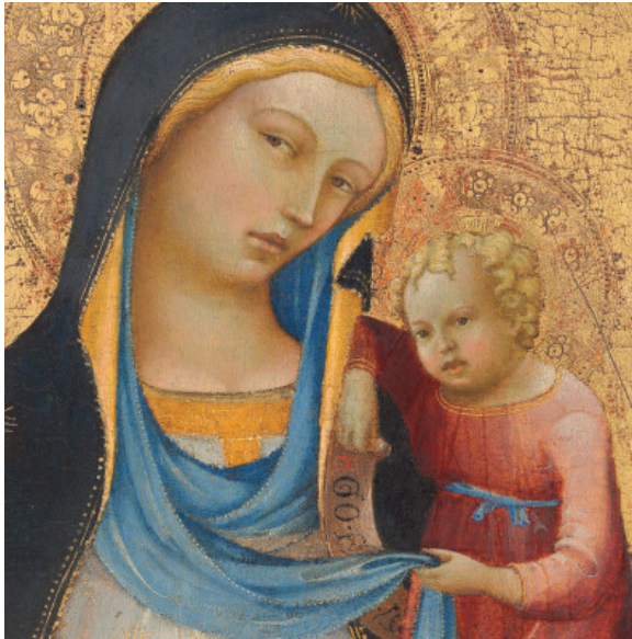
fig. 1 Detail, Lorenzo Monaco, Madonna and Child , 1413, tempera on panel, National Gallery of Art, Washington, Samuel H. Kress Collection