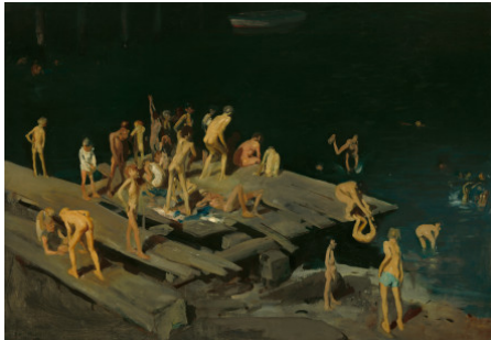
George Bellows American, 1882 - 1925