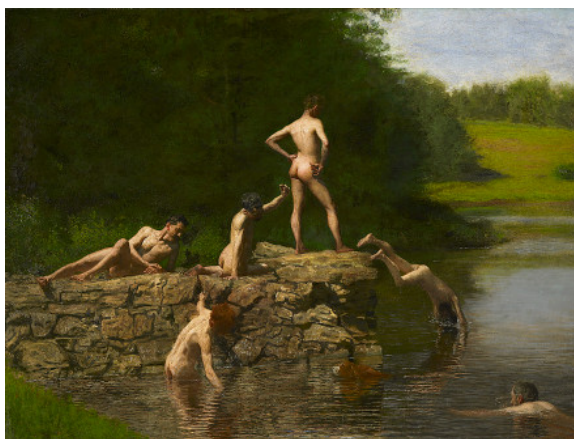
fig. 3 Thomas Eakins, Swimming , 1885, oil on canvas, Amon Carter Museum of Art, Fort Worth, Texas