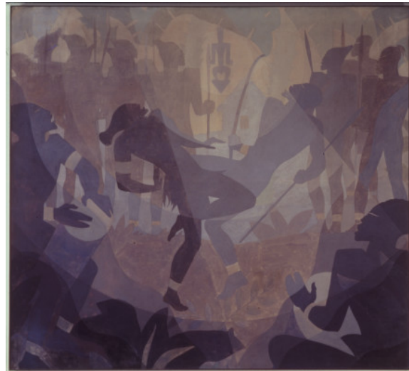
fig. 4 Aaron Douglas, Aspects of Negro Life: The Negro in an African Setting, 1934 , oil on canvas, The New York Public Library, Schomburg Center for Research in Black Culture, Art and Artifacts Division.