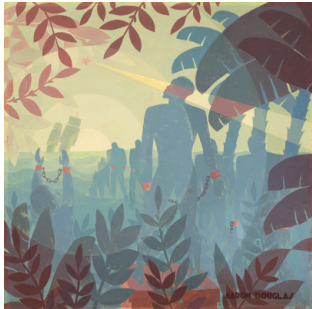
Aaron Douglas American, 1899 - 1979