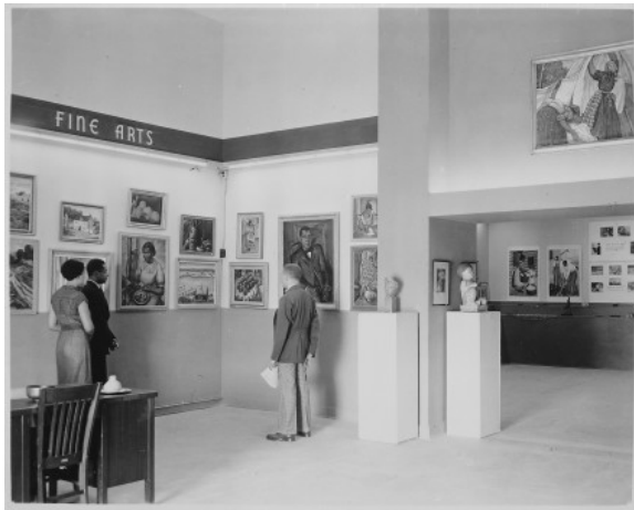
fig. 3 Texas Centennial Exhibit, Hall of Negro Life, 1936 , photograph, US National Archives