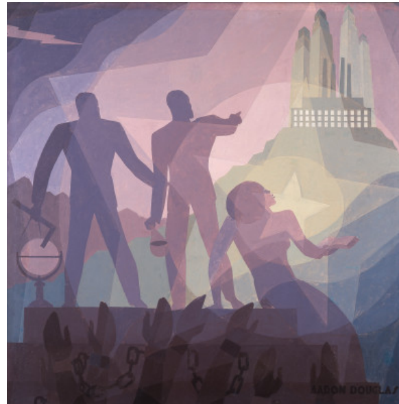
fig. 2 Aron Douglas, Aspiration , 1936, oil on canvas, The Fine Arts Museums of San Francisco