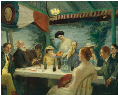
John Sloan American, 1871 - 1951