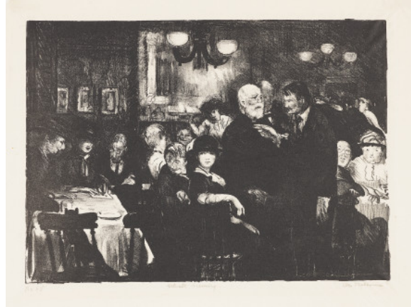
fig. 2 George Bellows, Artists' Evening, 1916, lithograph, The Fine Arts Museums of San Francisco, Museum Purchase, Achenbach Foundation for Graphic Arts Endowment Fund, 1967.22.11.