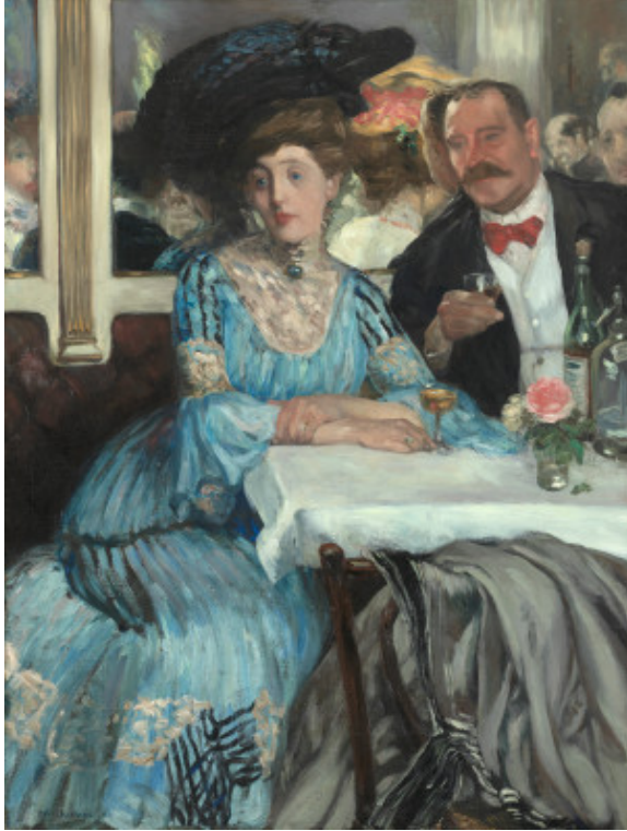
fig. 1 William Glackens, At Mouquin's , 1925, oil on canvas, The Art Institute of Chicago, Friends of American Art Collection, 1925.295.