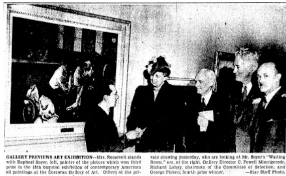
fig. 2 "Five Thousand Attend Preview of Corcoran's 18th Biennial Exhibition," Washington Star , Mar. 21, 1943