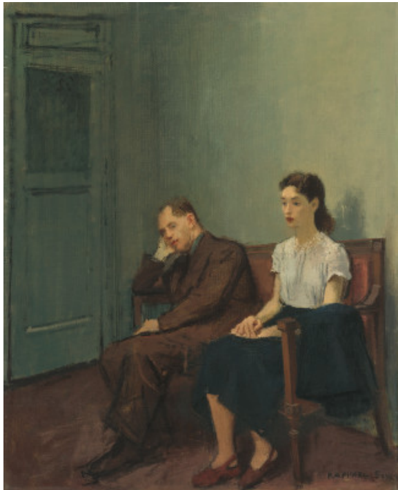
fig. 1 Raphael Soyer, Waiting for the Audition , c. 1950, oil on canvas, National Gallery of Art, Washington, Corcoran Collection (Museum Purchase, William A. Clark Fund), 2015.19.75