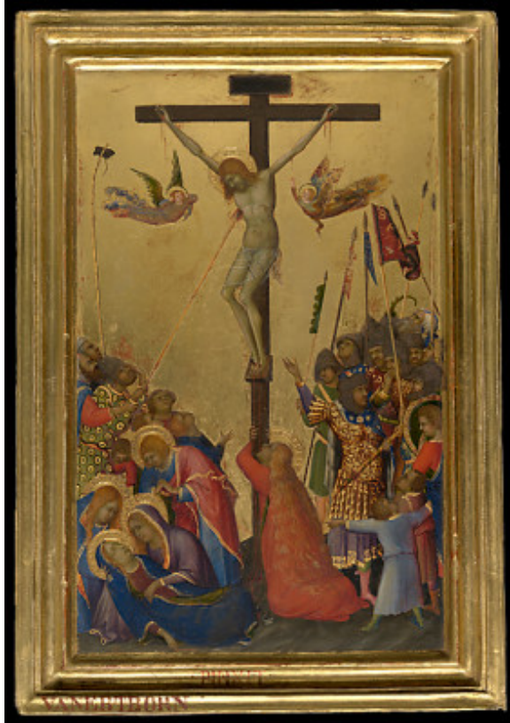
fig. 1 Simone Martini, Crucifixion (from the Orsini Polyptych), c. 1335, tempera on panel, Royal Museum of Fine Arts, Antwerp