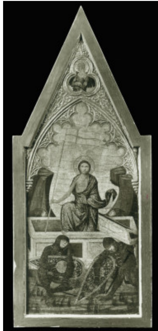
fig. 4 Andrea di Vanni, Resurrection , c. 1380s, tempera on panel, location unknown, formerly in the Ingenheim collection