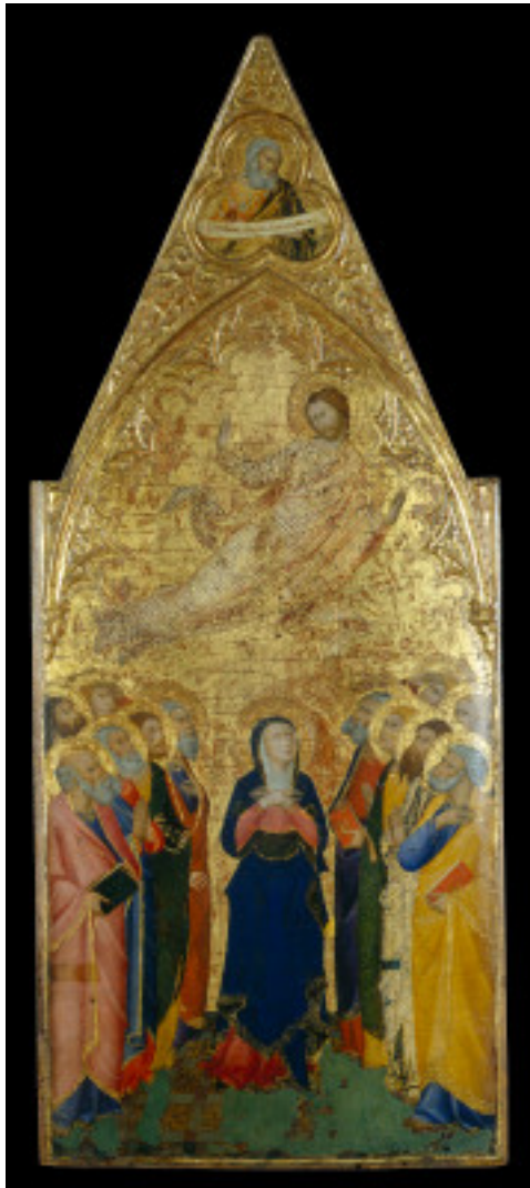
fig. 3 Andrea di Vanni, Ascension , c. 1380s, tempera on panel, The State Hermitage Museum, St. Petersburg, Gift of the heirs of Count G. S. Stroganov, 1911