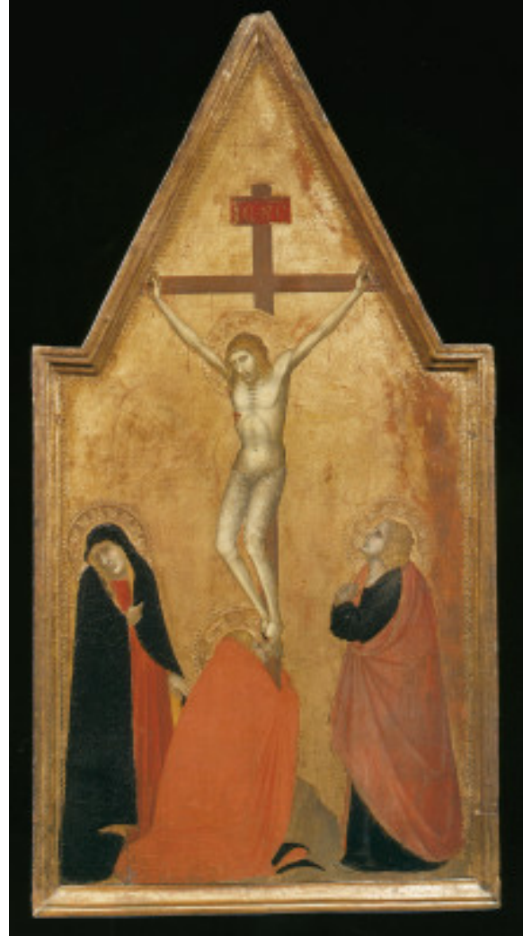
fig. 2 Pietro Lorenzetti, Crucifixion , c. 1325–1326, tempera on panel, Pinacoteca Nazionale, Siena