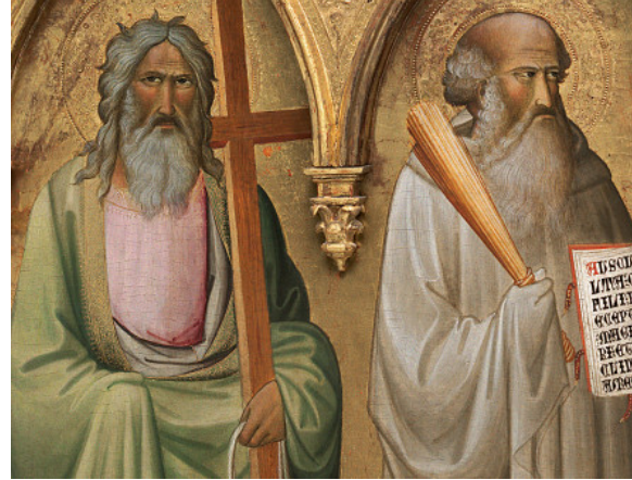
fig. 2 Detail of Saint Andrew (left), Agnolo Gaddi, Madonna and Child with Saints Andrew, Benedict, Bernard, and Catherine of Alexandria with Angels , shortly before 1387, tempera on poplar, National Gallery of Art, Washington, Samuel H. Kress Collection