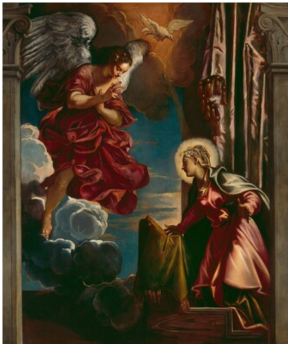
fig. 1 Jacopo Tintoretto, The Annunciation , late 1570s, oil on canvas, Scuola Grande Arciconfraternita di San Rocco, Venice