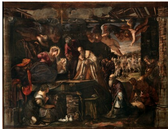
fig. 2 Jacopo Tintoretto, The Adoration of the Magi , 1581–1582, oil on canvas, Scuola Grande Arciconfraternita di San Rocco, Venice.