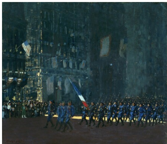
fig. 1 George Luks, Blue Devils on Fifth Avenue , 1918, oil on canvas, The Phillips Collection, Washington, DC, acquired 1918