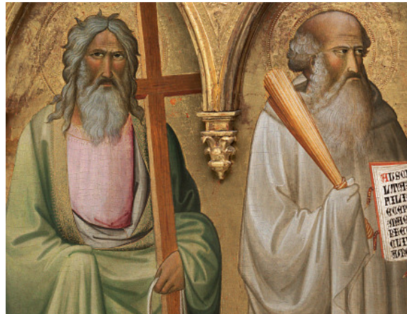
fig. 2 Detail of Saint Andrew (left), Agnolo Gaddi, Madonna and Child with Saints Andrew, Benedict, Bernard, and Catherine of Alexandria with Angels , shortly before 1387, tempera on poplar, National Gallery of Art, Washington, Samuel H. Kress Collection