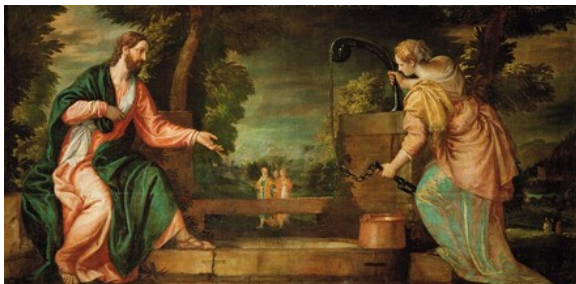
fig. 1 Veronese and Workshop, Christ and the Samaritan Woman , c. 1585, oil on canvas, Kunsthistorisches Museum, Vienna.