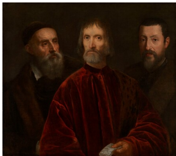
fig. 2 After Titian, Titian and His Friends, c. 1550/1560, oil on canvas