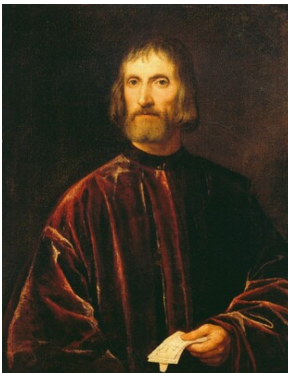
fig. 1 Titian, Andrea dei Franceschi , c. 1533, oil on canvas, Detroit Institute of Arts