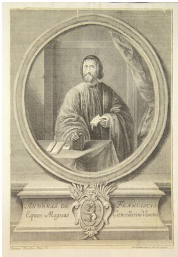
fig. 3 Crescenzo Ricci, after Titian, Portrait of Andrea de' Franceschi , 18th century, engraving, Museo Correr.