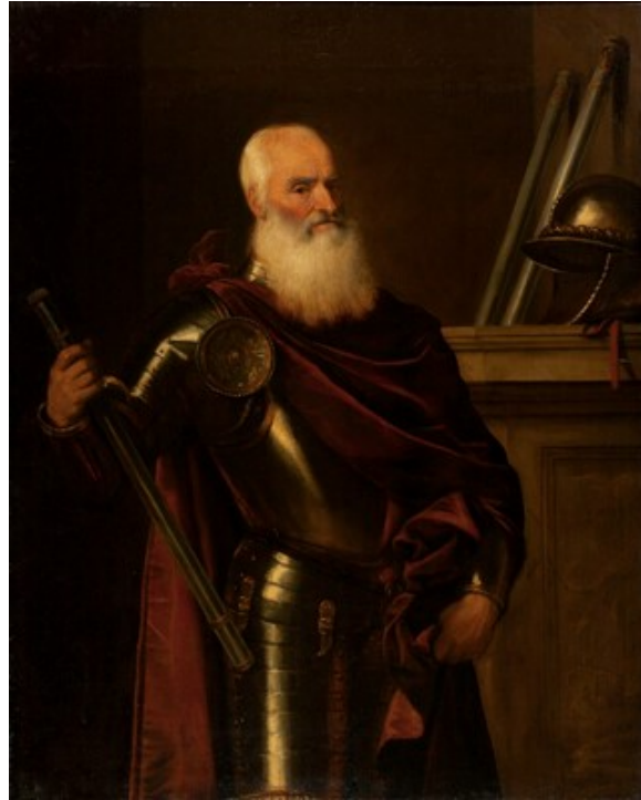
fig. 2 Here attributed to Workshop of Titian, Portrait of Admiral Vincenzo Cappello , c. 1560/1570, oil on canvas, The State Hermitage Museum, Saint Petersburg.