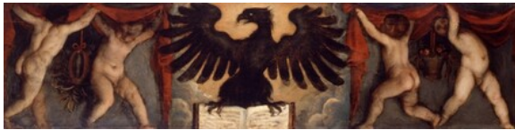
fig. 1 Titian and Workshop, Symbol of John the Evangelist from the ceiling of the Scuola di San Giovanni Evangelista, c. 1553/1555, oil on panel, Gallerie dell'Accademia, Venice. Su concessione del Ministero del beni e delle attività culturali e del turismo. Museo Nazionale Gallerie dell'Accademia di Venezia © Archivio fotografico G.A.VE