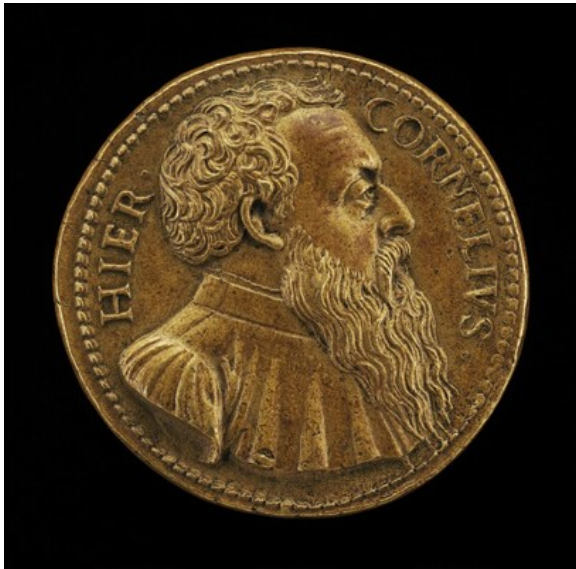
fig. 3 Giovanni da Cavino, Girolamo Cornaro , c. 1486–1551, Venetian Patrician, 1540, bronze, National Gallery of Art, Washington, Samuel H. Kress Collection