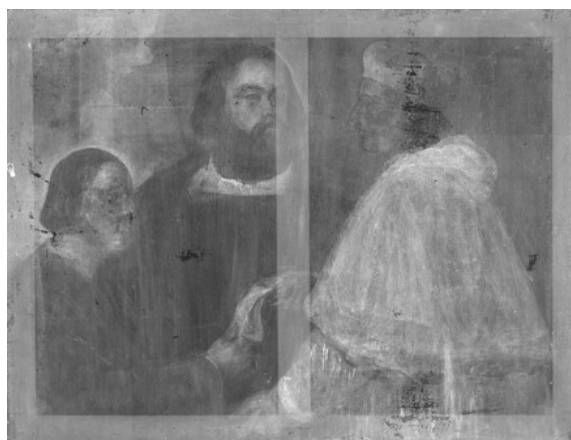
fig. 2 X-radiograph, Follower of Titian, Girolamo and Cardinal Marco Corner Investing Marco, Abbot of Carrara, with His Benefice , c. 1520/1525, oil on canvas, National Gallery of Art, Washington, Timken Collection