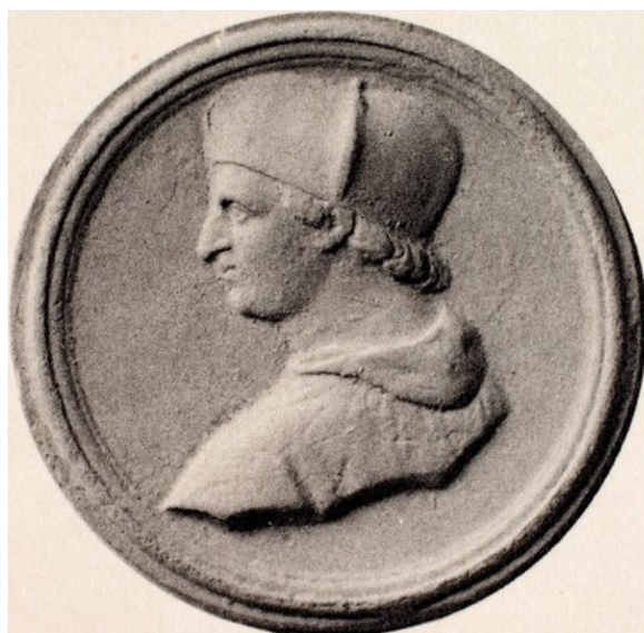
fig. 1 Anonymous portrait medal of Marco Corner (Bibliothèque nationale de France), from George Francis Hill, A Corpus of Italian Medals of the Renaissance before Cellini , vol. 2 (London, 1930), plate 96, no. 528.