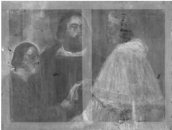
fig. 1 X-radiograph, Follower of Titian, Girolamo and Cardinal Marco Corner Investing Marco, Abbot of Carrara, with His Benefice , c. 1520/1525, oil on canvas, National Gallery of Art, Washington, Timken Collection