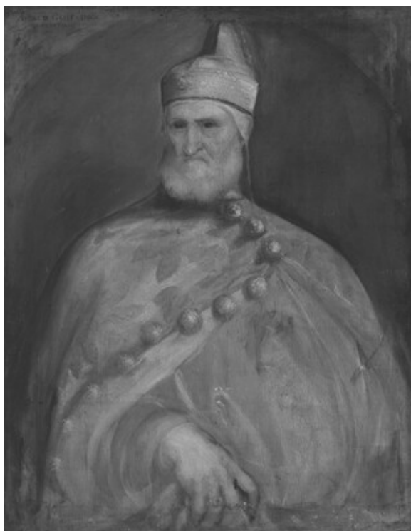
fig. 1 Infrared reflectogram, Titian, Doge Andrea Gritti , c. 1546/1550, oil on canvas, National Gallery of Art, Washington, Samuel H. Kress Collection