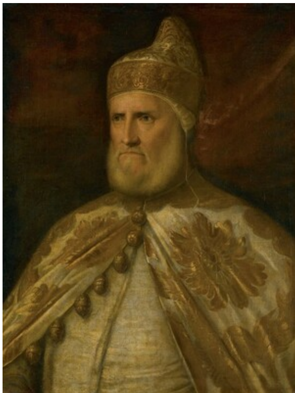
fig. 1 Workshop of Titian, Portrait of Doge Andrea Gritti , c. 1540, oil on canvas, Private Collection