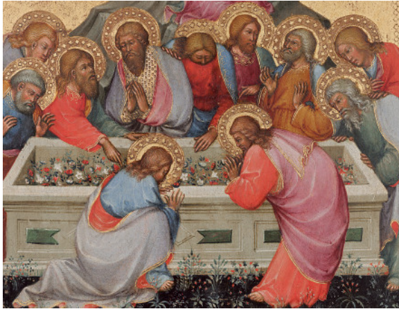
fig. 3 Detail of figures reacting to the miracle of the flowers in place of Mary's body, Paolo di Giovanni Fei, The Assumption of the Virgin with Busts of the Archangel Gabriel and the Virgin of the Annunciation , c. 1400/1405, tempera on panel, National Gallery of Art, Washington, Samuel H. Kress Collection