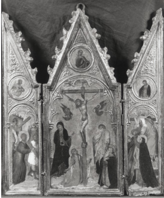
fig. 1 Paolo di Giovanni Fei, triptych, location unknown