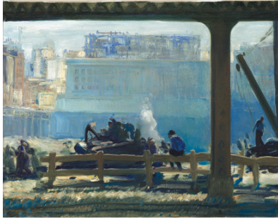
George Bellows American, 1882 - 1925