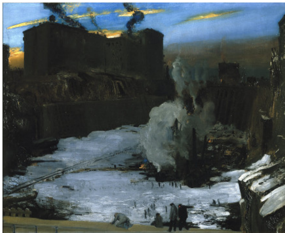
fig. 3 George Bellows, Pennsylvania Station Excavation , c. 1907–1908, oil on canvas, Brooklyn Museum of Art, A. Augustus Healy Fund