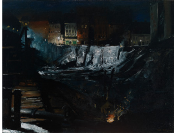
fig. 2 George Bellows, Excavation at Night , 1908, oil on canvas, Crystal Bridges Museum of Art