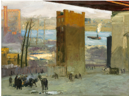
George Bellows American, 1882 - 1925