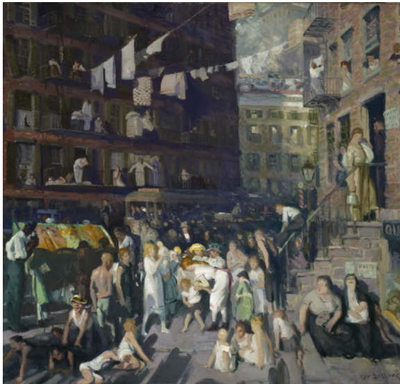
fig. 3 George Bellows, Cliff Dwellers , 1913, oil on canvas, Los Angeles County Museum of Art, Los Angeles County Fund (16.4)