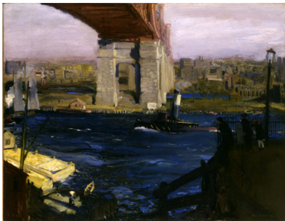
fig. 1 George Bellows, The Bridge, Blackwell's Island , 1909, oil on canvas, Toledo Museum of Art, Gift of Edward Drummond Libbey.