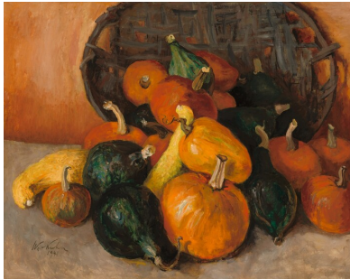
Walt Kuhn American, 1877 - 1949