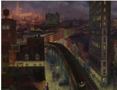
John Sloan American, 1871 - 1951