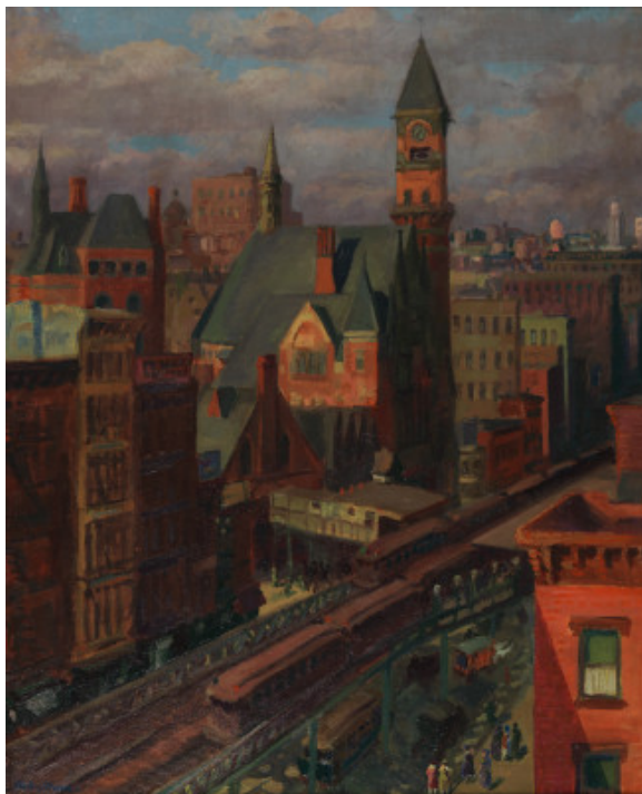
fig. 1 John Sloan, Jefferson Market, 1917, retouched 1922, oil on canvas, Pennsylvania Academy of the Fine Arts, Philadelphia.