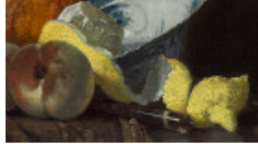
fig. 2 Detail of lemon, Willem Kalf, Still Life , c. 1660, oil on canvas, National Gallery of Art, Washington, Chester Dale Collection, 1943.7.8