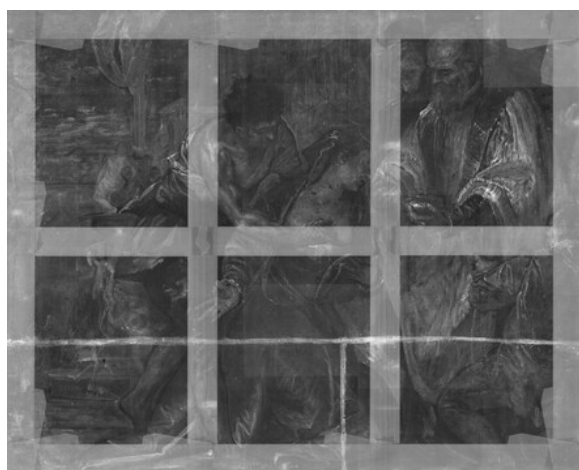
fig. 1 X-radiograph, Veronese, The Martyrdom and Last Communion of Saint Lucy , c. 1585/1586, oil on canvas, National Gallery of Art, Washington, Gift of The Morris and Gwendolyn Cafritz Foundation and Ailsa Mellon Bruce Fund