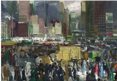
George Bellows American, 1882 - 1925