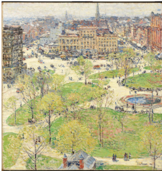
fig. 2 Childe Hassam, Union Square in Spring , 1896, oil on canvas, Smith College Museum of Art, Northampton, Massachusetts, purchased with the Winthrop Hillyer Fund