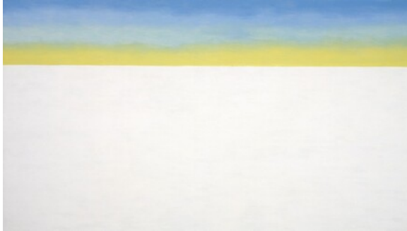
fig. 1 Georgia O'Keeffe, Sky Above the Flat White Cloud II, 1960–1964, oil on canvas, Georgia O'Keeffe Museum, Santa Fe, NM, Gift of The Georgia O'Keeffe Foundation, 2006.5.364.