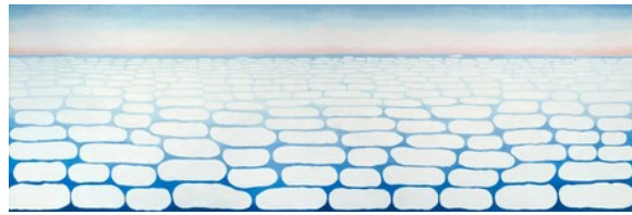
fig. 6 Georgia O'Keeffe, Sky Above Clouds IV , 1965, oil on canvas, The Art Institute of Chicago, Restricted gift of the Paul and Gabriella Rosenbaum Foundation; gift of Georgia O'Keeffe, 1983.821.