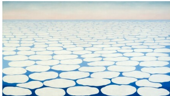
fig. 4 Georgia O'Keeffe, Sky Above Clouds III , 1963, oil on canvas, private collection.