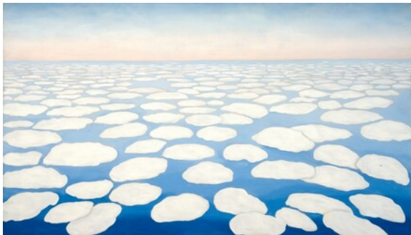
fig. 3 Georgia O'Keeffe, Sky Above Clouds II , 1963, oil on canvas, private collection.