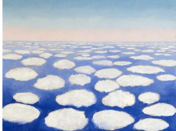
fig. 2 Georgia O'Keeffe, Above the Clouds I, 1962–1963, oil on canvas, Georgia O'Keeffe Museum, Santa Fe, NM, Gift of The Burnett Foundation and The Georgia O'Keeffe Foundation, 1997.5.14.