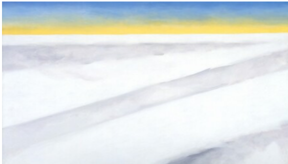
fig. 5 Georgia O'Keeffe, Clouds 5/Yellow Horizon and Clouds, 1963–1964, oil on canvas, Georgia O'Keeffe Museum, Santa Fe, NM, Gift of The Georgia O'Keeffe Foundation, 2006.05.364.