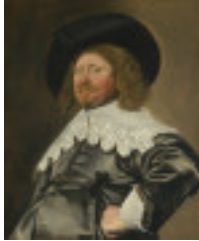
fig. 1 Frans Hals, Claes Duyst van Voorhout , c. 1638, oil on canvas, The Metropolitan Museum of Art, New York, Jules Bache Collection, 1949.