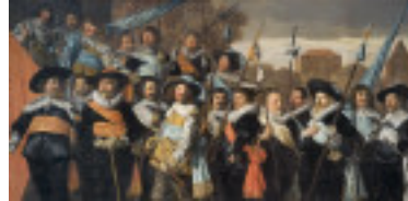
fig. 2 Frans Hals, Officers and Sergeants of the Saint George Civic Guard Company, c. 1639, oil on canvas, Frans Hals Museum, Haarlem.