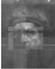
fig. 1 Detail of head, X-radiograph composite, Rembrandt van Rijn, Self-Portrait , 1659, oil on canvas, National Gallery of Art, Washington, Andrew W. Mellon Collection, 1937.1.72