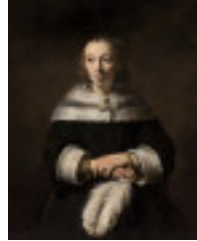
fig. 2 Rembrandt van Rijn, Portrait of a Lady with an Ostrich-Feather Fan , c. 1656/1658, oil on canvas transferred to canvas, National Gallery of Art, Washington, Widener Collection, 1942.9.68