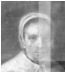
fig. 3 Detail of head, X-radiograph composite, Rembrandt van Rijn, A Woman Holding a Pink , 1656, oil on canvas, National Gallery of Art, Washington, Andrew W. Mellon Collection, 1937.1.75