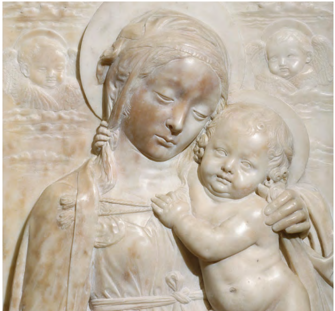
Benedetto da Maiano, Madonna and Child (detail), c. 1475, marble, National Gallery of Art, Washington, Samuel H. Kress Collection

End of day (National Gallery of Art closes at 5:00)