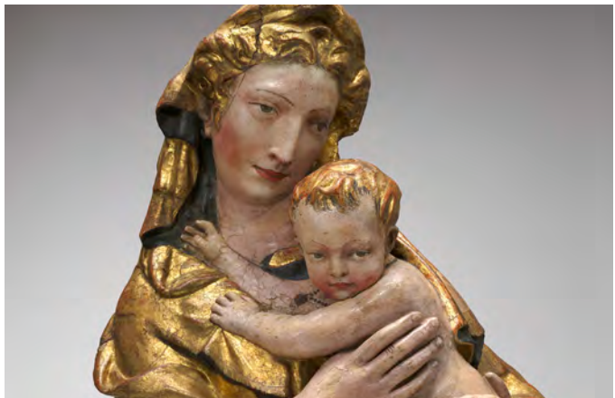
Florentine 15th Century, Madonna and Child (detail), c. 1425, painted and gilded terracotta with wood backing, National Gallery of Art, Washington, Samuel H. Kress Collection

End of day (National Gallery of Art closes at 5:00)