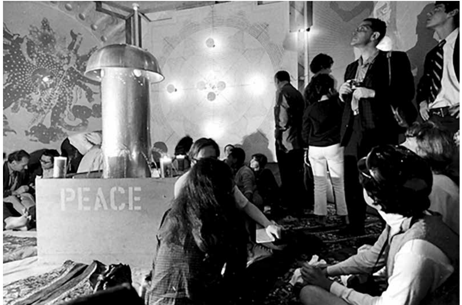
USC's Tabernacle, Garnerville, New York, 1967.

Films, Performance, and Conversation with 1960s Multimedia Pioneers