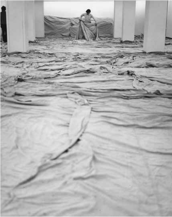
Christo covers the floors with fabric for Wrapped Floor and Stairway, Museum of Contemporary Art, Chicago, 1968 - 69, 1969, gelatin silver print, Shunk-Kender Photography Collection, Department of Image Collections, National Gallery of Art Library, Gift of the Roy Lichtenstein Foundation in memory of Harry Shunk and János Kender. (cat. 11)