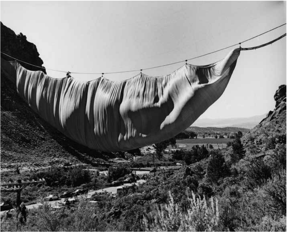
Unfurling of curtain for Valley Curtain, Rifle, Colorado, 1970 - 72, August 10, 1972, gelatin silver print, Shunk-Kender Photography Collection, Department of Image Collections, National Gallery of Art Library, Gift of the Roy Lichtenstein Foundation in memory of Harry Shunk and János Kender. © Christo. (cat. 50)