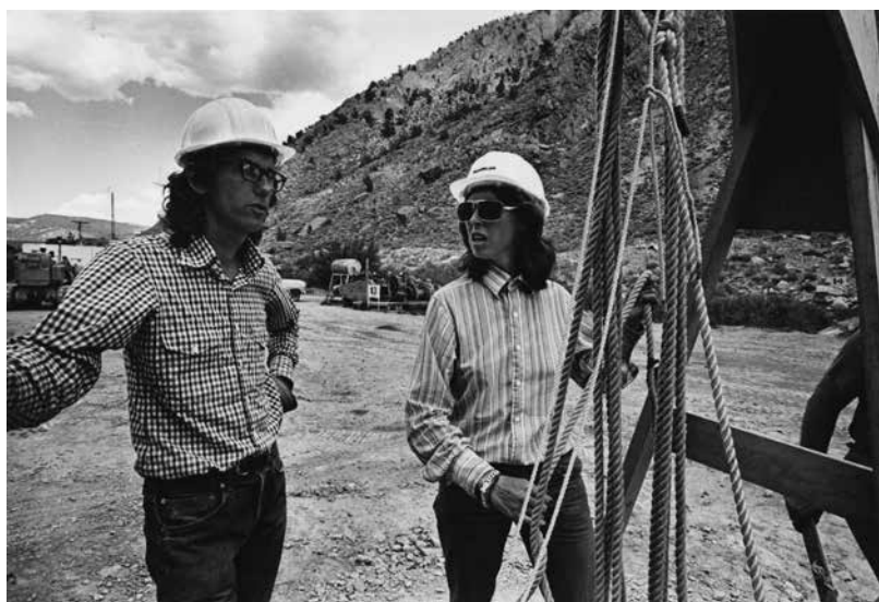
TOP Harry Shunk (left) and János Kender at a dinner for artist Lucio Fontana at La Coupole in Montparnasse, Paris, 1961. BOTTOM Christo and Jeanne-Claude on-site during construction of Valley Curtain, Rifle, Colorado, 1970 - 72, 1972, gelatin silver print