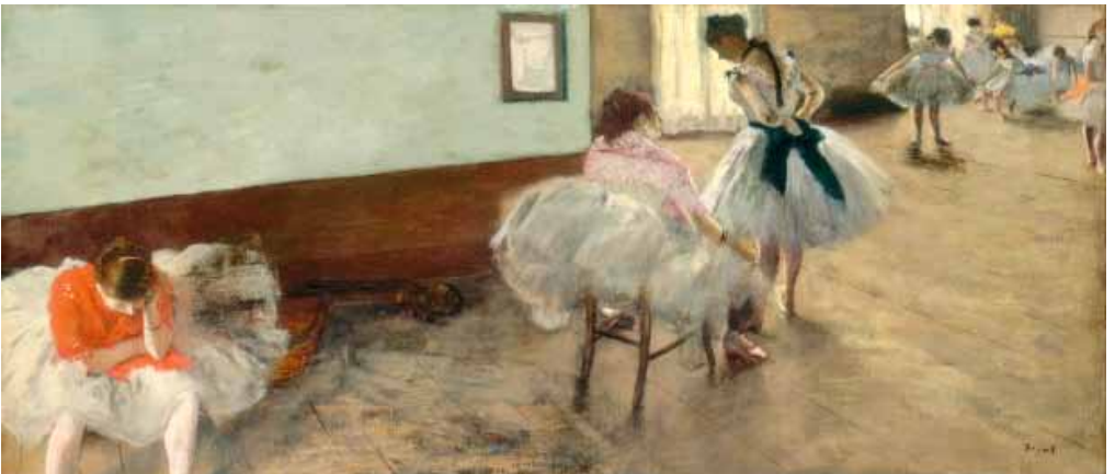
Fig. 3 Edgar Degas, The Dance Lesson , c. 1879, oil on canvas. National Gallery of Art, Washington, Collection of Mr. and Mrs. Paul Mellon