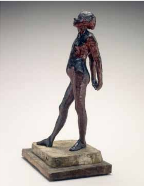
Fig. 9 Edgar Degas, Study in the Nude of Little Dancer Aged Fourteen (Nude Little Dancer) , c. 1878 – 1881, pigmented beeswax, plaster core, metal and wood armatures, on plaster and wooden bases. National Gallery of Art, Washington, Collection of Mr. and Mrs. Paul Mellon

nude figure was essentially cast in molds taken from an earlier, lost study in wax or clay, suggesting it is an independent variant of the Little Dancer Aged Fourteen . Degas seems to have worked on both the full-sized version and the smaller surviving nude simultaneously, and may have continued to adjust the nude figure even after the dressed version was exhibited. His change in the position of the right foot, for instance, left an impression still visible in the plaster base.