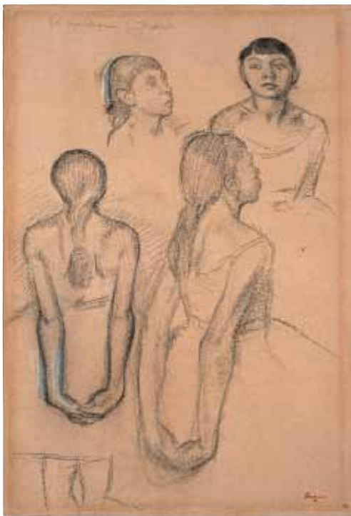
Fig. 5 Edgar Degas, Four Studies of a Dancer, c. 1878 – 1881, chalk and charcoal, heightened with gray wash and white, on buff wove paper. Musée du Louvre, Paris, Département des Arts Graphiques, Fonds du Musée d'Orsay. (not in exhibition)