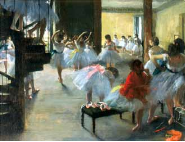
Fig. 1 Edgar Degas, The Dance Class ( Ecole de Danse ), c. 1873, oil on canvas. Trustees of the Corcoran Collection (William A. Clark Collection)