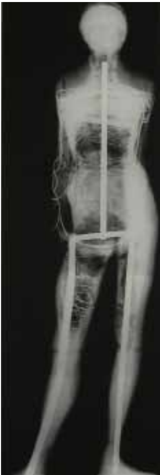
Fig. 8 Schematic diagram of the internal armature of Little Dancer Aged Fourteen . Illustration by Julia Sybalsky and Abigail Mack, 2007