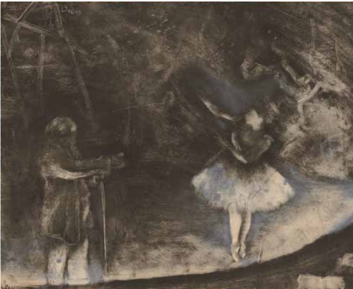
Fig. 11 Edgar Degas, executed in col- laboration with Vicomte Lepic, The Ballet Master (Le maître de ballet) , c. 1874, monotype heightened and corrected with white chalk or wash. National Gallery of Art, Washington, Rosenwald Collection

black-clad gentleman, gazing from a theater box or side wing or standing backstage (figs. 2, 10). Such figures were wealthy ballet subscribers who were granted access to behind-the-scenes spaces at the opera house — and hence to dancers, often becoming their “protectors,” a subject of salacious gossip.