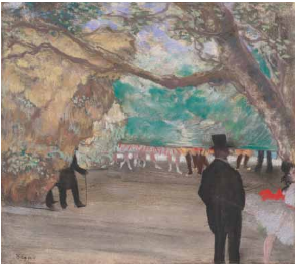
Fig. 10 Edgar Degas, The Curtain , c. 1880, pastel over charcoal and monotype on laid paper mounted on board, National Gallery of Art, Washington, Collection of Mr. and Mrs. Paul Mellon