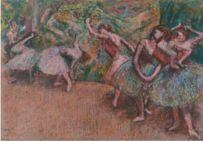
Fig. 12 Edgar Degas, Ballet Scene , c. 1907, pastel on greenish transparent tracing paper. National Gallery of Art, Washington, Chester Dale Collection

printmaker who introduced him to the challenging technique. Printed in black ink and enhanced with white chalk or wash, the figures emerge eerily from the inky darkness. In other monotypes Degas added pastel to the printed image (fig. 10), conferring glowing color on performers and stage sets under theatrical lighting.