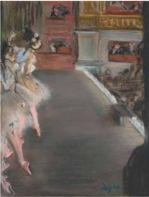
Fig. 2 Edgar Degas, Dancers at the Old Opera House , c. 1877, pastel over monotype on laid paper. National Gallery of Art, Washington, Ailsa Mellon Bruce Collection