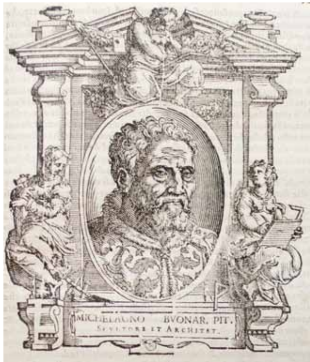
1 Giorgio Vasari, Michelangelo Buonarroti , woodcut, from Le vite de' più eccellenti pittori, scultori e architettori (Florence, 1568). National Gallery of Art Library, Washington, Gift of E. J. Rousuck