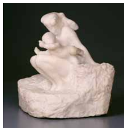
5 Michelangelo, David-Apollo (side view), c. 1530