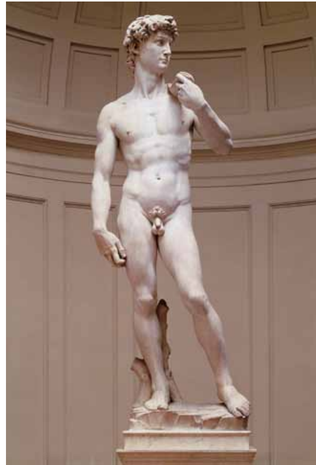
2 Michelangelo, David , 1501–1504, marble, h. 516 cm (including base). Galleria dell'Accademia, Florence

The loan of Michelangelo's David-Apollo (COVER) from the Museo Nazionale del Bargello, Florence, to the National Gallery of Art opens the Year of Italian Culture, 2013. This rare marble statue visited the Gallery once before, more than sixty years ago, to reaffirm the friendship and cultural ties that link the peoples of Italy and the United States. Its installation here in 1949 coincided with Harry Truman's inaugural reception.