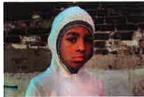
Robert Bergman, Untitled , 1987, photograph printed 2004, National Gallery of Art, Washington, Anonymous Donation

National Gallery of Art, Washington—October 11, 2009–January 10, 2010