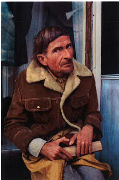
Robert Bergman, Untitled , 1989 inkjet print, printed 2004 Anonymous Gift.

Washington, DC—In the first solo exhibition of American photographer Robert Bergman (b. 1944), approximately 30 color portraits will display the artist's exceptional ability to reveal the singular nature of each of his subjects and their common humanity. On view at the National Gallery of Art, Washington, from October 11, 2009, through January 10, 2010, Robert Bergman: Portraits, 1986–1995 presents everyday people the artist encountered in the streets of the United States during his travels from 1985 to 1997.