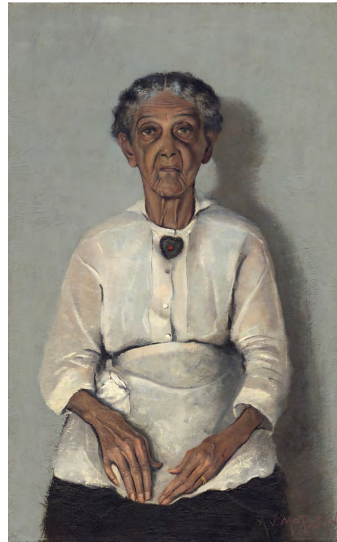
Archibald John Motley Jr., Portrait of My Grandmother , 1922, oil on canvas, National Gallery of Art, Washington, Patrons' Permanent Fund, Avalon Fund, and Motley Fund, 2018.2.1 (Gallery 71)