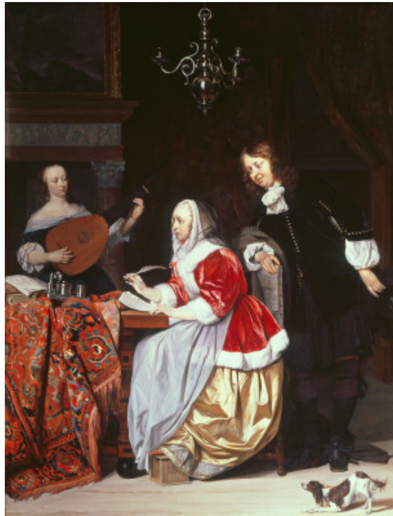
fig. 2 Gabriel Metsu, A Young Woman Composing Music , c. 1662-1663, oil on panel, Mauritshuis, The Hague