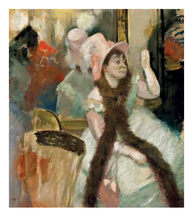
Fig. 2 Edgar Degas, Portrait after a Costume Ball (Portrait of Mme Dietz-Monnin), 1879, distemper with metallic paint and pastel on canvas, The Art Institute of Chicago, Joseph Winterbotham Collection.

The 1879 impressionist exhibition proved to be a watershed in both artists' careers. For her debut, Cassatt exhibited a dozen works, including Little Girl in a Blue Armchair , while Degas, one of the organizers, showed twenty-five according to the 1879 catalog. Both made bold choices. Cassatt opted to exhibit certain works in colored frames and Degas featured works in unusual formats, such as a group of painted fans that combined an appreciation for Japanese art with his preferred subject of the ballet. They used unconventional materials as well. In his Portrait after a Costume Ball (Portrait of Mme Dietz-Monnin) (fig. 2), Degas juxtaposed broad strokes of metallic paint and areas of distemper (pigment mixed