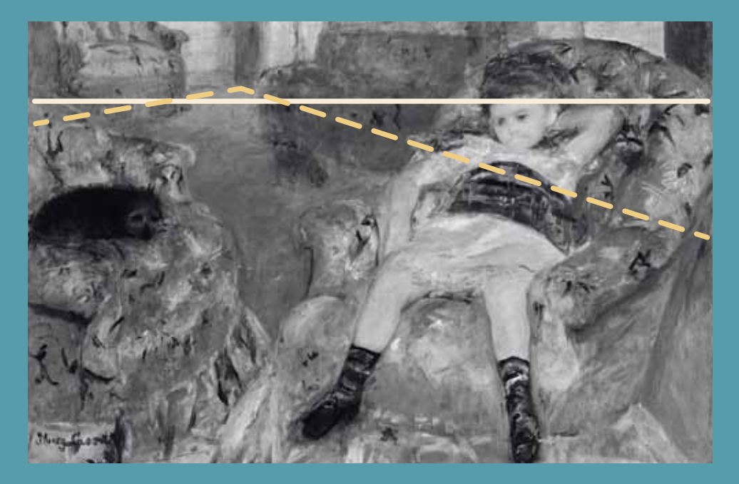
Infrared reflectogram composite of Little Girl in a Blue Armchair (fig. 1) with Cassatt's original demarcation (solid line) and Degas's alteration (broken line)

When Degas proposed adding a corner, Cassatt had to make adjustments. She repositioned the armless couch in the center of the picture, heavily reworking it to align with the now sloping wall. She also explored the best position for the dog. The infrared image indicates that she had tried placing it on the floor, seated in front of the reworked couch. But she opted for her original arrangement and returned the dog to its upholstered perch, where it now slumbers comfortably.