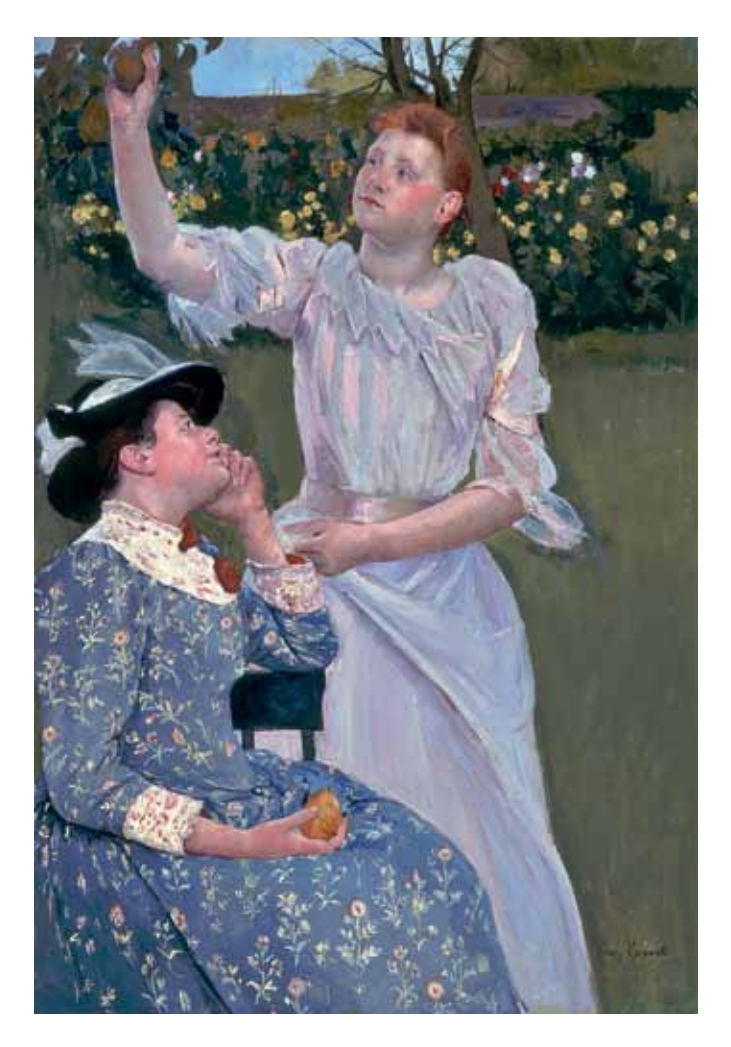
Fig. 9 Mary Cassatt, Young Women Picking Fruit, 1891, oil on canvas, Carnegie Museum of Art, Pittsburgh, Patrons Art Fund.

The final impressionist exhibition in 1886 marked a turning point in Degas and Cassatt's relationship. Although their friendship endured until his death, their interactions diminished as they began to move in different directions. For Cassatt, the most noticeable change was in subject matter. Depictions of mothers and children, which had begun to appear in her work in the early 1880s, came to dominate during the latter part of her career and now stand as her most popular images. Her style also evolved: As Young Women Picking Fruit (fig. 9) reveals, Cassatt's colors became bold and her patterns elaborate, while the energetic brushwork of her earlier impressionist paintings grew more controlled and her figures gained a new solidity. In the late 1880s and 1890s, Degas's art underwent a radical stylistic transformation.