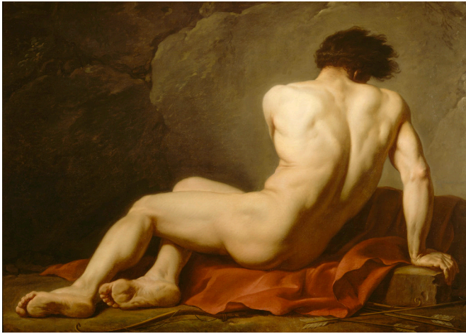
FIG. 10 Jacques-Louis David, Male Nude Study, called Patroclus, 1780, 48 × 67 in., Musée d'Art Thomas Henry, Cherbourg. The back view of the Dying Gaul inspired David's portrayal of "Patroclus," painted while the artist was at the French Academy in Rome.