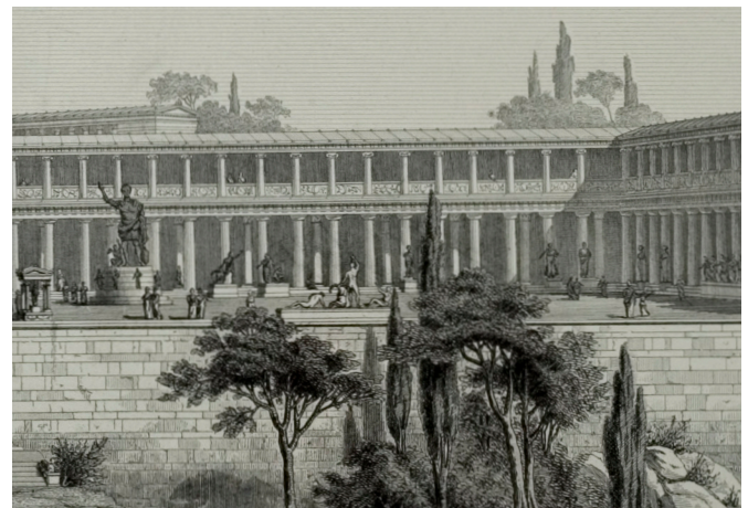
FIG. 5 Hypothetical reconstruction of the Sanctuary of Athena, Pergamon (detail)