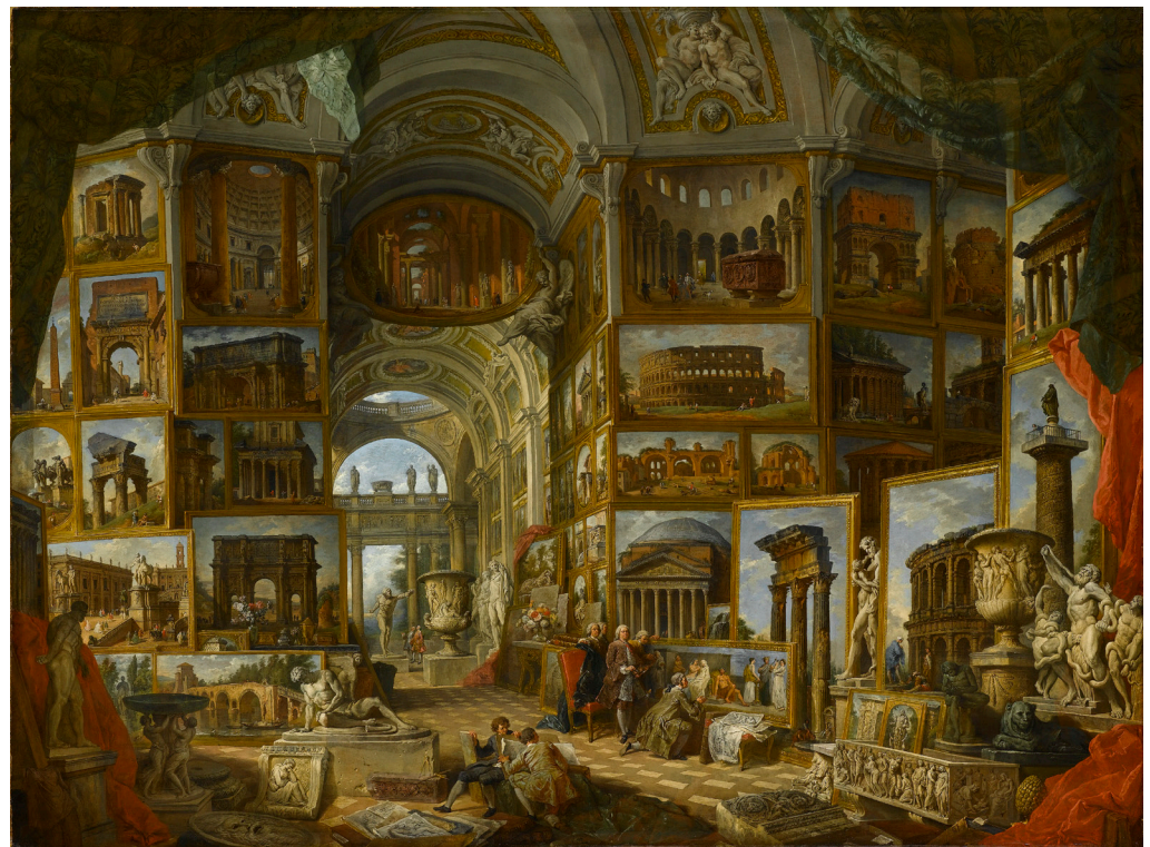
FIG. 11 Giovanni Paolo Panini, Ancient Rome , 1754/1757, 66½ × 89 in., Staatsgalerie, Stuttgart. The Dying Gaul is to the left of center.

The exhibition is organized by Roma Capitale, Sovrintendenza Capitolina—Musei Capitolini, and the National Gallery of Art, together with the Embassy of Italy, Washington. It is part of The Dream of Rome and 2013—The Year of Italian Culture in the U.S. , which is organized under the auspices of the President of the Italian Republic by The Italian Ministry of Foreign Affairs and the Embassy of Italy in Washington, in collaboration with the Ministero per i Beni e le Attività Culturali.