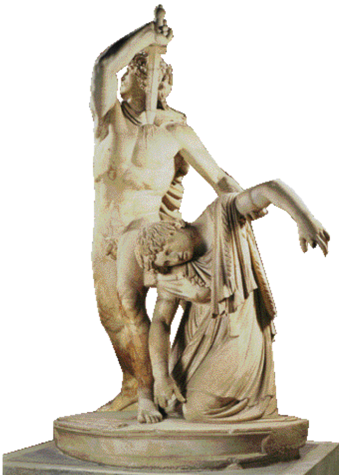
FIG. 2 Roman, Gaul Committing Suicide with His Wife , 1st or 2nd century AD, marble, h. 83 in., Museo Nazionale Romano (Palazzo Altemps), Rome, Italy.