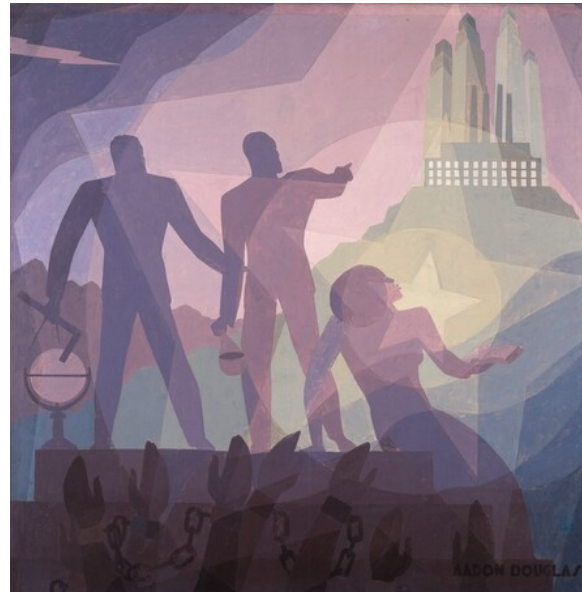
fig. 2 Aron Douglas, Aspiration , 1936, oil on canvas, The Fine Arts Museums of San Francisco