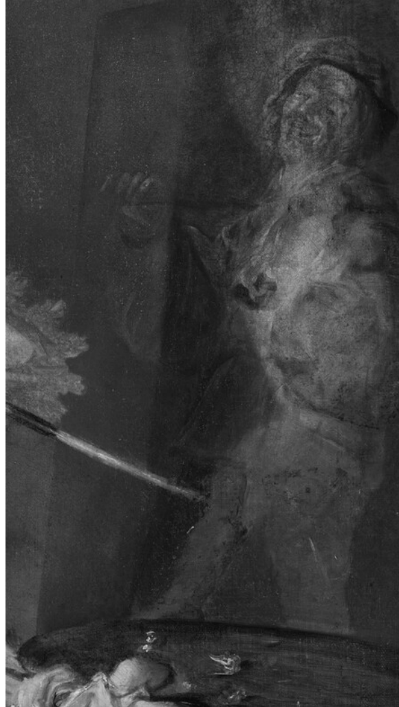
fig. 2 Detail, infrared reflectogram, Judith Leyster, Self-Portrait , c. 1630, oil on canvas, National Gallery of Art, Washington, Gift of Mr. and Mrs. Robert Woods Bliss, 1949.6.1